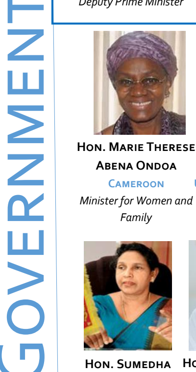
UNITED ARAB EMIRATES Minister for Women and

INTERNATIONAL MONE-TARY FUND Managing Director